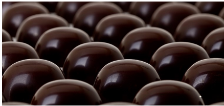
Dark Chocolate 64% Tobago 22lb Case #23105