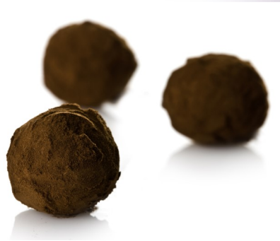
Cocoa Powder 21% (Alkalized Cocoa) 2.2lb Bag #23120