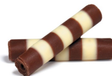
Duo Mistral 1"