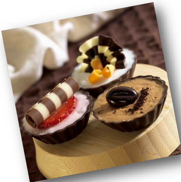
Petit Four Chocolate Cups Assorted 168ct Box #23090 2.0" x 0.6"