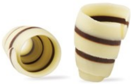
Rose Duo Chocolate 180ct Tray #23015 .70" x 1.0"