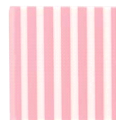
Domino Square Pink/White