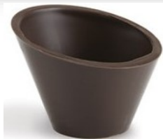
Pisa Cup 105ct Box #23010 1.5" x 1.6"