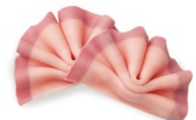
Forest Shaving Midi Pink 200ct Tray #23127