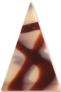
Diablo Triangle 290ct Tray #23041 1.3" x 2.0"