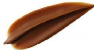
Elegance Milk 160ct Tray #23088 2.4" x 0.9"