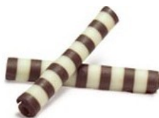
Twister Dark/White 1"