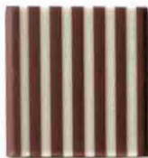
Domino Square Dark/White